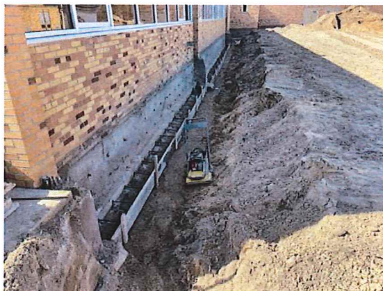
HS office Footing Tie In