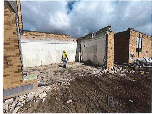
Old Horizons / Athletic Office Demo