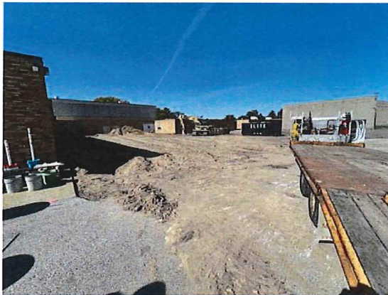
HS Office and Classroom Site