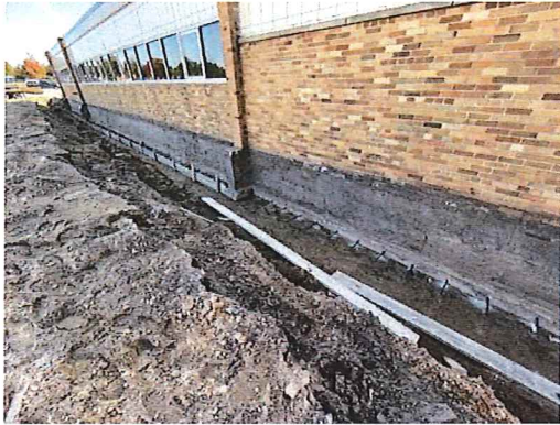
Footing Tie In