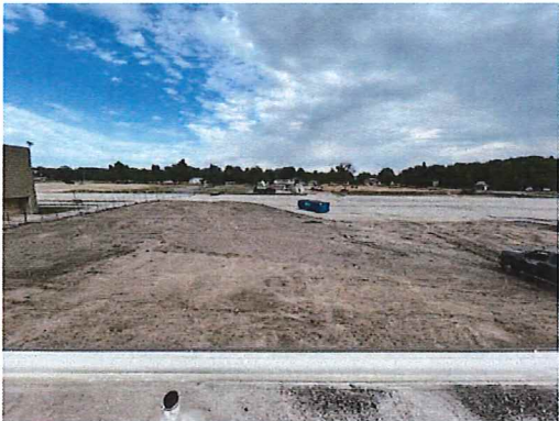
Overall Building Site