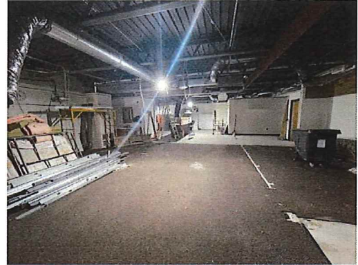
Horizons Area Demo