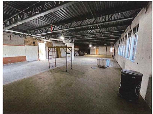
Athletic office / Horizons Demo