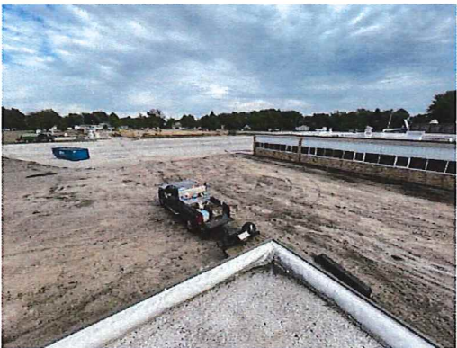
Overall Building Site