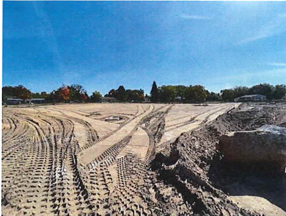
HS Student Parking Prep